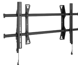
CHIEF LARGE FUSION FIXED FLAT PANEL WALL MOUNT | LSA1U