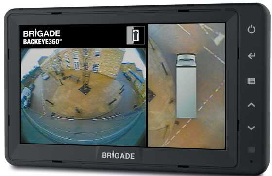
Actual Backeye®360 image

The flexibility of the Brigade systems means there are solutions suitable for both on-and off-road applications.