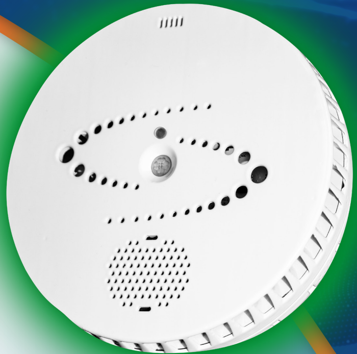
HALO Smart Sensor is Multi-Patented and Design is Trademarked

New security and environmental monitoring features provide users with even greater levels of security and easier installation. These features add to HALO's existing features of gunshot detection, noise alerts, and emergency keyword alerting.